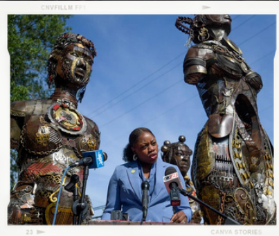
CHART THE COURSE ON MATERNAL CARE THROUGH ADVOCACY AND POLICY REFORM